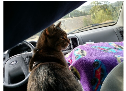
I The ninja: BEST. CAT. EVER. August 2015, somewhere in BC, CAN.

*Yes, I rank the ninja cat higher than any my current three, and even Mouse who was with me from kindergarten through early Dec. of my first semester of grad school. Though the ninja juuuuust barely eeks BEST EVER over Mouse. They're tied, really.