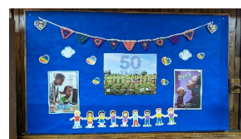
I Bulletin board @ELCP after Ladies' Aid cleared out the undercroft and refreshed the bulletin boards.

As I said, we do tend to emphasize the money aspect of stewardship in church-speak. But take a moment to think about the other ways our congregations have seen stewardship in action. The stewardship care involved in Sunday morning worship happening- altar guild, ushering, cleaning, etc., all the “behind the scenes” stuff that happens throughout the week, throughout the month. Recently, we’ve been focused a lot on the stewardship of our buildings and properties. Both congregations had special summer to discuss and approve money for building projects. We’re signs and siding, updated heating, and having trees taken down fall in storms and cause other property damage. Special gifts have fixing our front doors and the chimney at Poestenkill, and we have gift at Faith that will help in the replacement of our front doors. year, different small groups have been working on cleaning out rooms and outdoor spaces, helping to make our facilities more