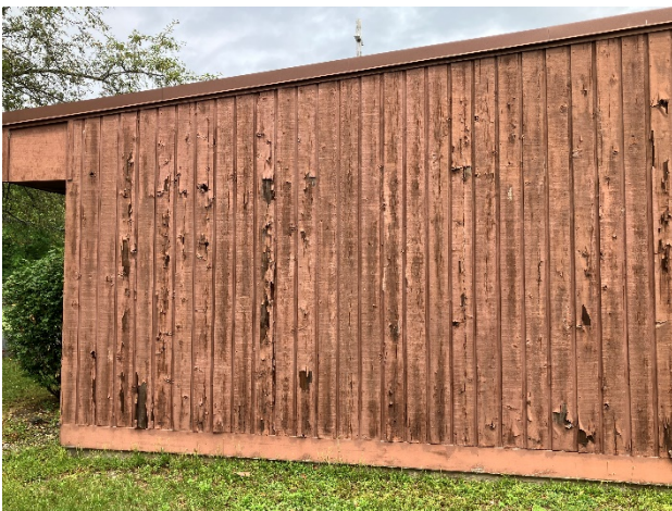
The South Wall (wall facing the bank) of the Multi-Purpose Room is in particularly bad condition.