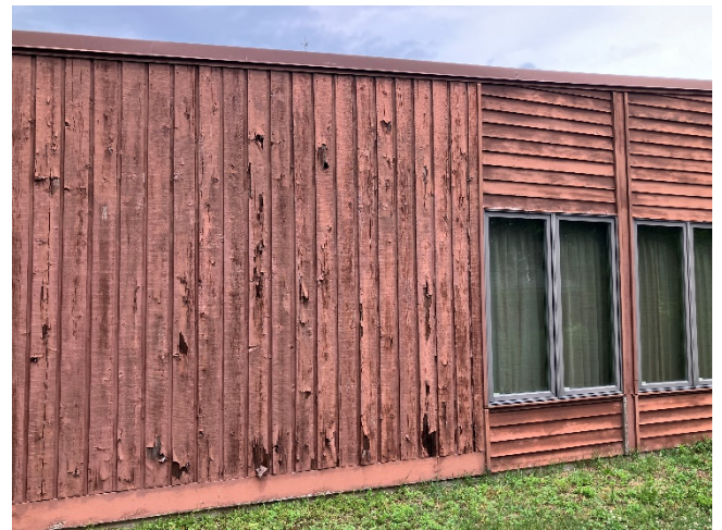
Second view of the South Wall of the Multi-Purpose Room. These windows have been previously replaced.