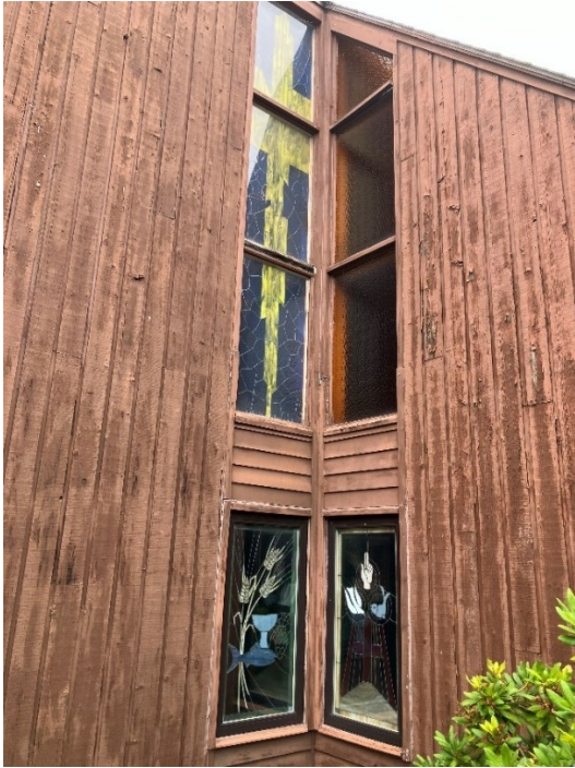
General condition of siding is not good. Siding has been rained several times, but is deteriorated to the point that this is no longer an option.