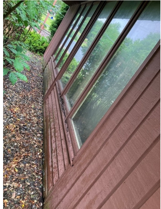
Two windows facing Leverage Road are rotted and structurally unsound. Must be replaced.