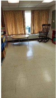
2 Sunday School classroom @Faith cleared out by Creative Threads.

We're small congregations. Very small congregations. That's just a fact. We, like everywhere, have seen a Sunday morning decline. Conversations about that, and how to change, "grow," and so on are happening everywhere. Important conversations, too, but not what I want to emphasize today. Our tiny size does not limit our vitality.